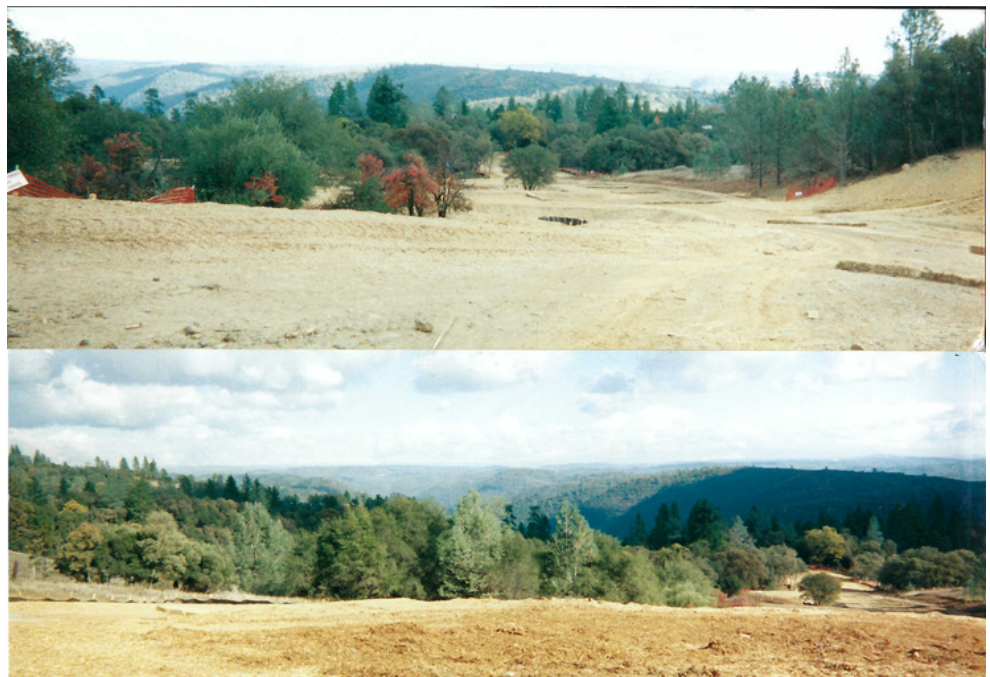
PLACER CANYON VIEW, 20 YEARS AGO