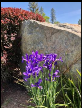
Placer Canyon View