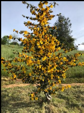
Placer Canyon View Homeowners Association

Please submit interesting photos and/or suggestions for information that you would like to appear in our newsletter to our Board President. The next edition will be published for April/May/June. Your input is valued.