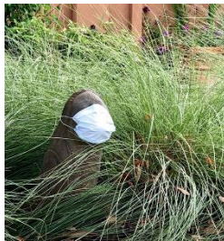
Be Well Dick Freeman

On the sign in form for the recent HOA Board meeting there was a column for an emergency contact number. This number would be used in the event there is a situation that the board determines a communication to the neighborhood is warranted. Possible reasons would be a suspicious person in the neighborhood or a fire in close proximity. If you would like to be added to the list please send the phone number of which you would like to be contacted to Dick Freeman. In the event a communication is required a text message would be sent to that phone number.