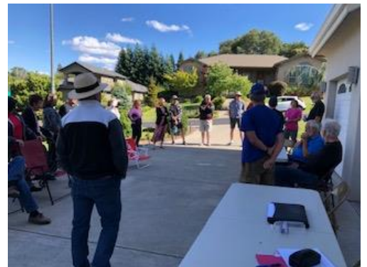
Outdoor Board Meeting awaiting Election Results