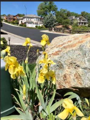
Placer Canyon View Homeowners Association

Provide feedback to help improve the overall association. Submit your comments and concerns by the first of every month to any Board member.